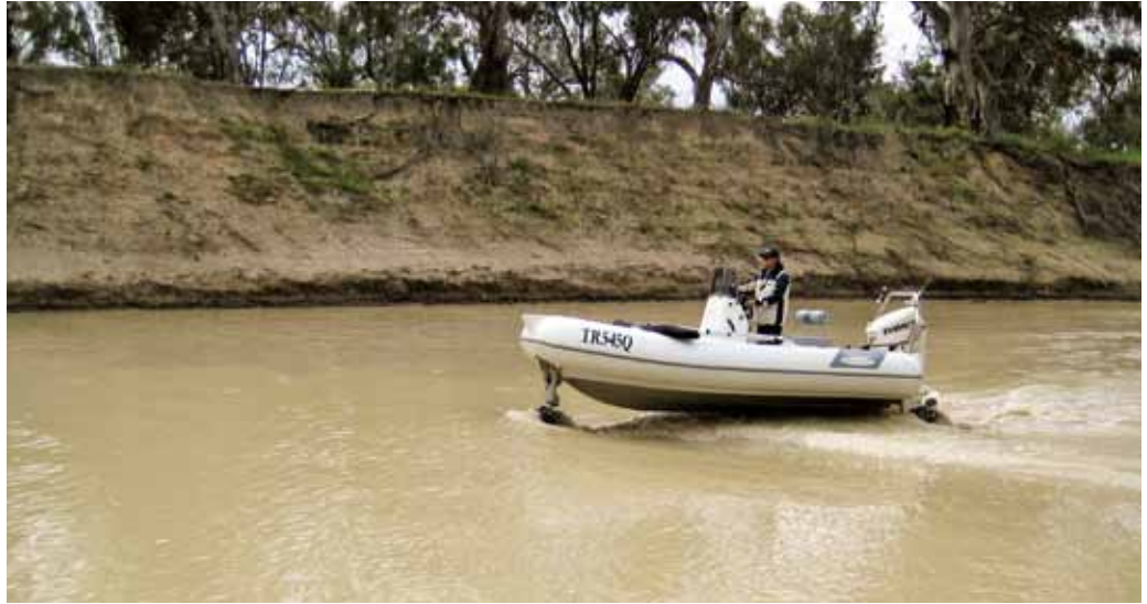
Right: It didn't take long for the crew to run out of water in the Darling.

property in turn. This was a great way to meet colourful and helpful locals, but the novelty quickly began to wear thin. Finally, the two parties found enough of a mobile phone signal to exchange text messages, and David found the crew.