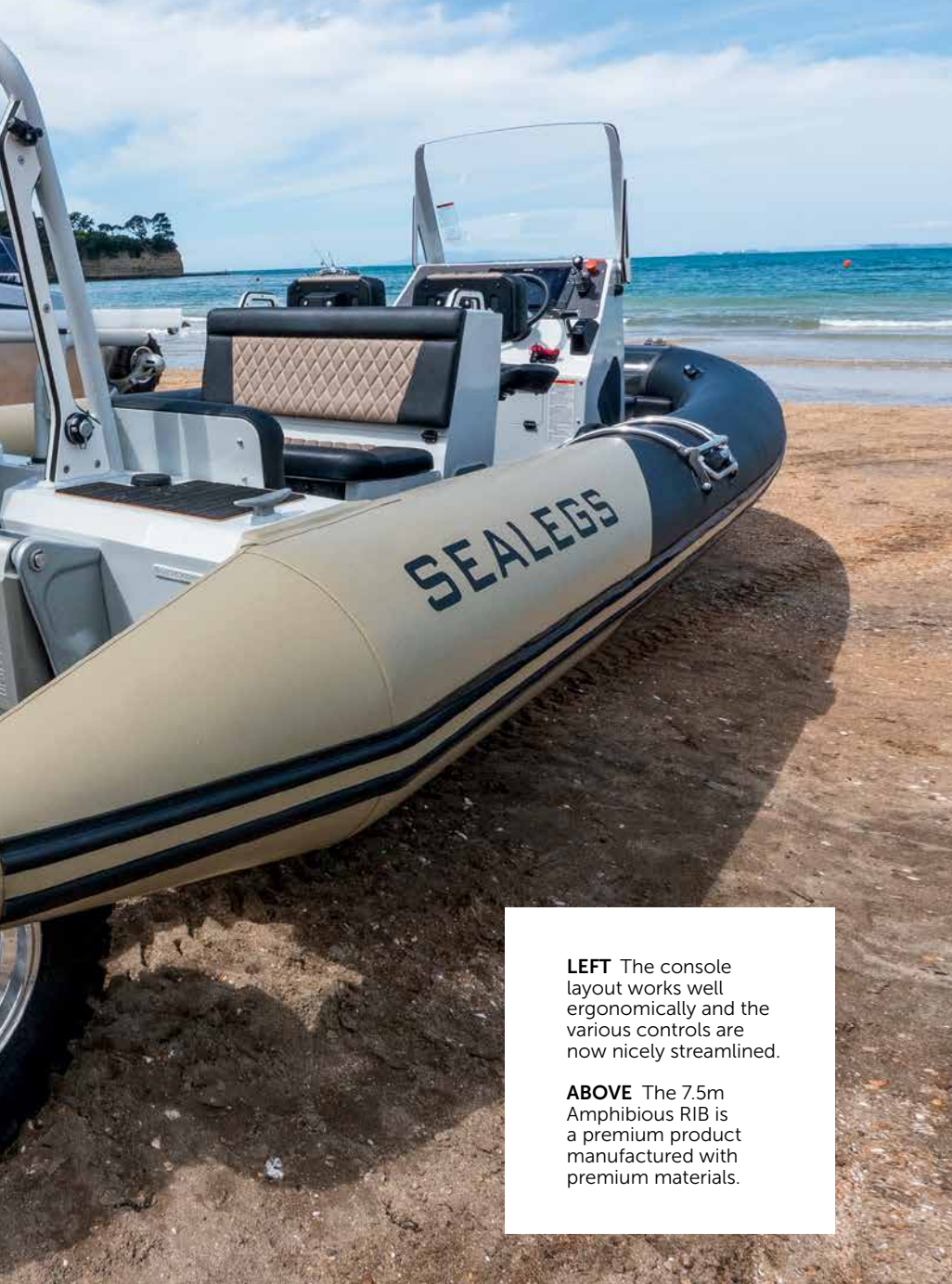
LEFT The console layout works well ergonomically and the various controls are now nicely streamlined. ABOVE The 7.5m Amphibious RIB is a premium product manufactured with premium materials.